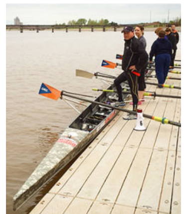
The 2015 PM crew gets ready for practice.

A: It was our first race and because of two more experienced rowers, we were actually thrown into a category higher than our overall experience level. It was an exciting environment because around 50 of our co-workers and friends had joined us and were so enthusiastic that we could hear them cheering from the starting line. I think our speed and agility surprised even those people in the boat. It's crazy how much faster you row in an actual race. Our co-workers were shocked that we beat our next competitor by three boat lengths! In fact, when we got off the water, I got a lot of comments like "wow, you guys really do know how to row." It's impressive what you can learn in one season of rowing together.