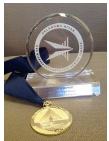
2014 trophy and medal

Q: How long has Phillips Murrah been participating in this?